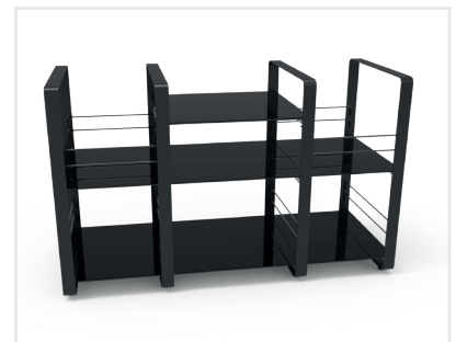
1 main unit / 2 side units Black finish