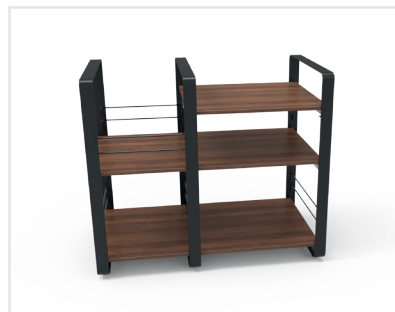
1 main unit / 1 side unit Walnut finish

Gross weight: Bamboo: 25.7 kg / Walnut: 25.4 kg / Black: 33.6 kg