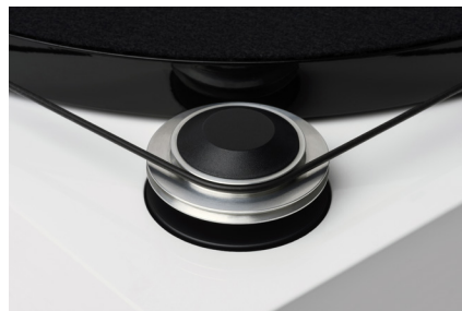
Diamond-cut aluminum drive pulley: precise power transmission