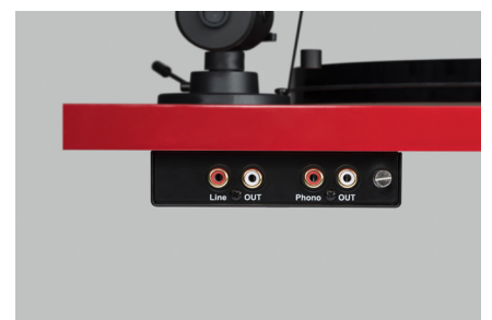
Switchable line or phono output and built-in Bluetooth transmitter