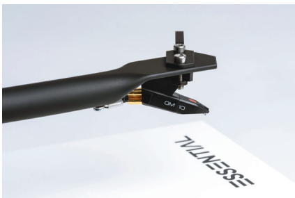
One piece 8.6" aluminum tonearm Cartridge: Ortofon OM10

Equipped with the high-quality pickup OM10 by the phonographic cartridge pioneer Ortofon, Essential III Bluetooth delivers lively, balanced and highly involving sound that will delight every vinyl lover. For the ease of use Essential III Bluetooth features two different analogue outputs (Phono out, Line Out) as well as aptX Bluetooth!