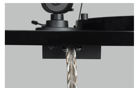
Pre-mounted Connect it E