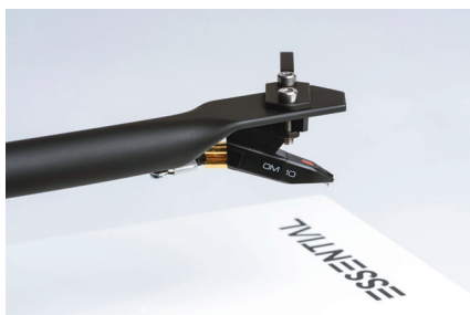
One piece 8.6" aluminum tonearm Cartridge: Ortofon OM10

Equipped with the high-quality pickup OM10 by the phonographic cartridge pioneer Ortofon, Essential III delivers lively, balanced and highly involving sound that will delight every vinyl lover.