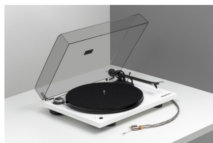
Dust cover, felt mat and high quality connection cable Connect-it E included