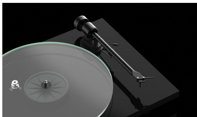
One-piece aluminium tonearm Robust and stiff construction for pure sound fidelity

Alongside the chosen motor system, the T1 is therefore able to ensure a smooth, anti-resonant rotational platform for the tonearm and cartridge to ride across.