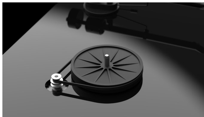
Ultra-precise motor and sub-platter design Lowest noise with immaculate speed stability

In the T1, the motor drives a belt-system, attached to a newly designed sub-platter, which is mounted into an ultra-precise 0.001mm main bearing with a hardened steel axle and brass bushing – just like our coveted Essential III turntables.