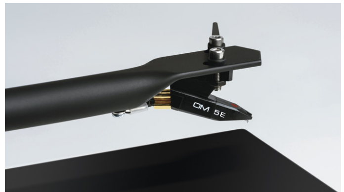
High-quality Ortofon OM 5E Moving Magnet cartridge with elliptical stylus tip

The T1 is a new affordable marvel. Still made in Europe by a turntable factory with decades of experience, it is a true hi-fi turntable that looks and sounds sublime.